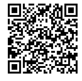
Scan To Shop