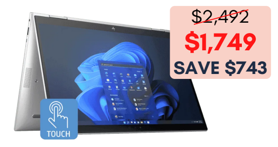
HP EliteBook x360 830 G9 13.3"

Ryzen 3 / 8GB RAM / 256 GB Free Delivery + Pen