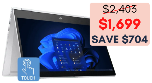
HP ProBook x360 435 G9 13.3"

AMD R7 / 16GB RAM / 512 GB Free Delivery + Pen