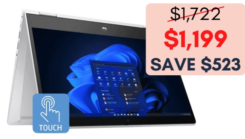
HP ProBook x360 435 G9 13.3"

AMD R7 / 16GB RAM / 512 GB Free Delivery + Pen