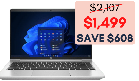
HP ProBook 440 G9 14"

Ryzen 5 / 8GB RAM / 256 GB Free Delivery