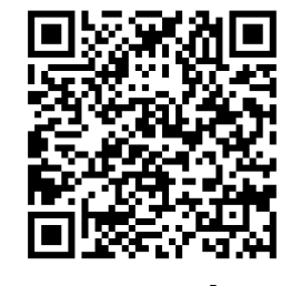
Scan To Shop

Pay with Visa, Mastercard, American Express, Afterpay, PayPal, G Pay, Apple Pay