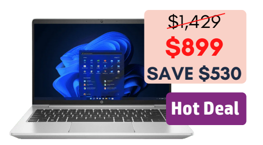
HP ProBook 445 G9 14"

Ryzen 5 / 8GB RAM / 256 GB Free Delivery