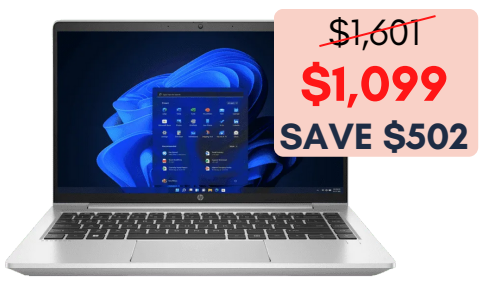
ProBook 440 Intel i5 (14")

Intel i7 / 16GB RAM / 512 GB Free Delivery